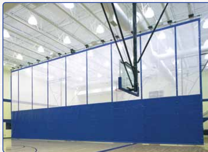
Greenfield Central Junior High School, Greenfield, IN. Architect: Odle, McGuire and Shook, Indianapolis, IN.

Dimensions, drawings and specifications: