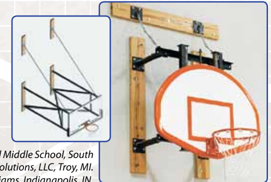
SW Stationary Backstop at Centennial Middle School, South Lyon, MI. Architect: Integrated Design Solutions, LLC, Troy, MI.