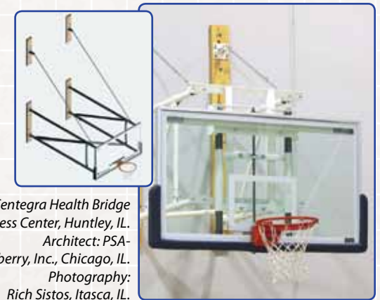
Centegra Health Bridge Fitness Center, Huntley, IL. Architect: PSA-Dewberry, Inc., Chicago, IL.